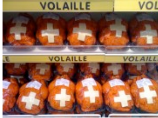
Swiss supermarkets prepare their best for the Swiss National Day: here, pastry crosses on oven-ready Swiss chickens

It took another 100 years, and a public referendum, before it became a recognized federal holiday in 1994.